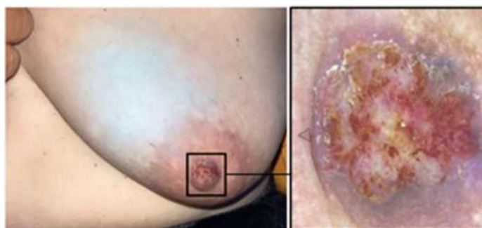
Figure 1. Erythematous scaly plaque on the left nipple.