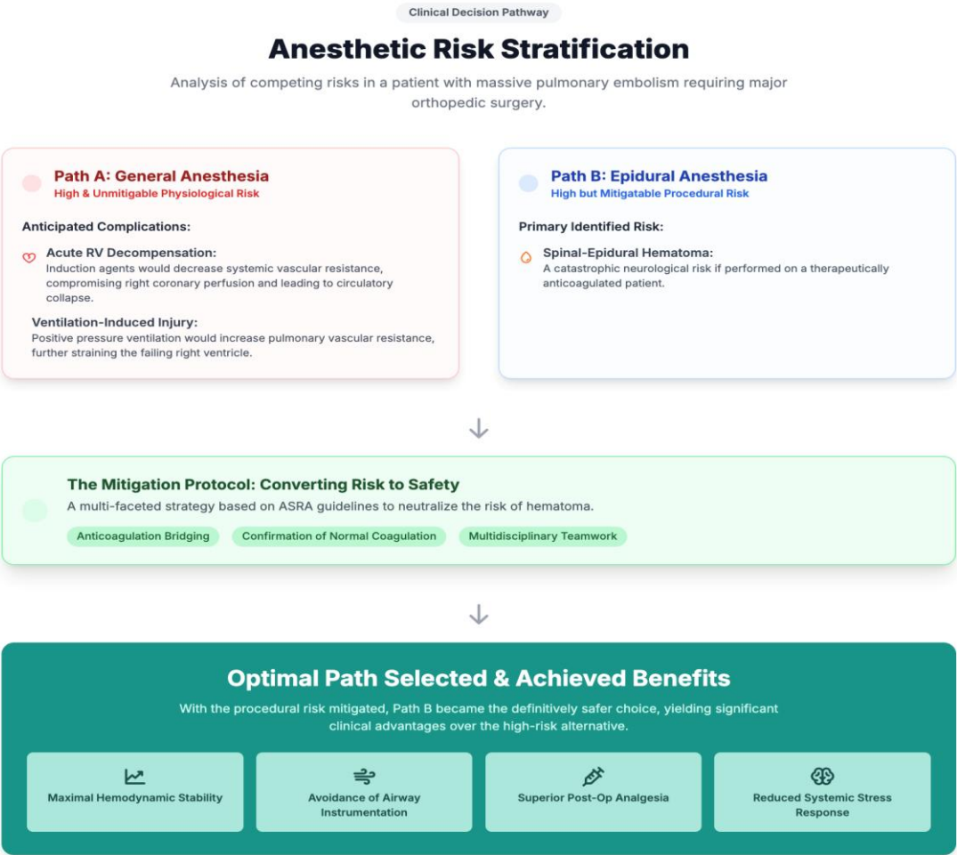
Figure 3. Clinical decision pathway.

cascade to return to normal, effectively rendering her non-anticoagulated for the brief, high-risk window of epidural needle and catheter placement. The final, non-negotiable step was the preoperative coagulation check. This is the ultimate safety net. The decision to proceed was not based on timing alone, but on objective laboratory evidence (an INR of 1.1) that the patient's hemostatic function was restored. This meticulous, step-by-step process transformed an absolute contraindication into a manageable risk. It demonstrates that the guidelines are not rigid barriers but sophisticated tools that, when used correctly, enable clinicians to provide advanced care that would otherwise be impossible. 15 The success of this case is a direct result of the team's respect for, and flawless execution of, these evidence-based protocols.