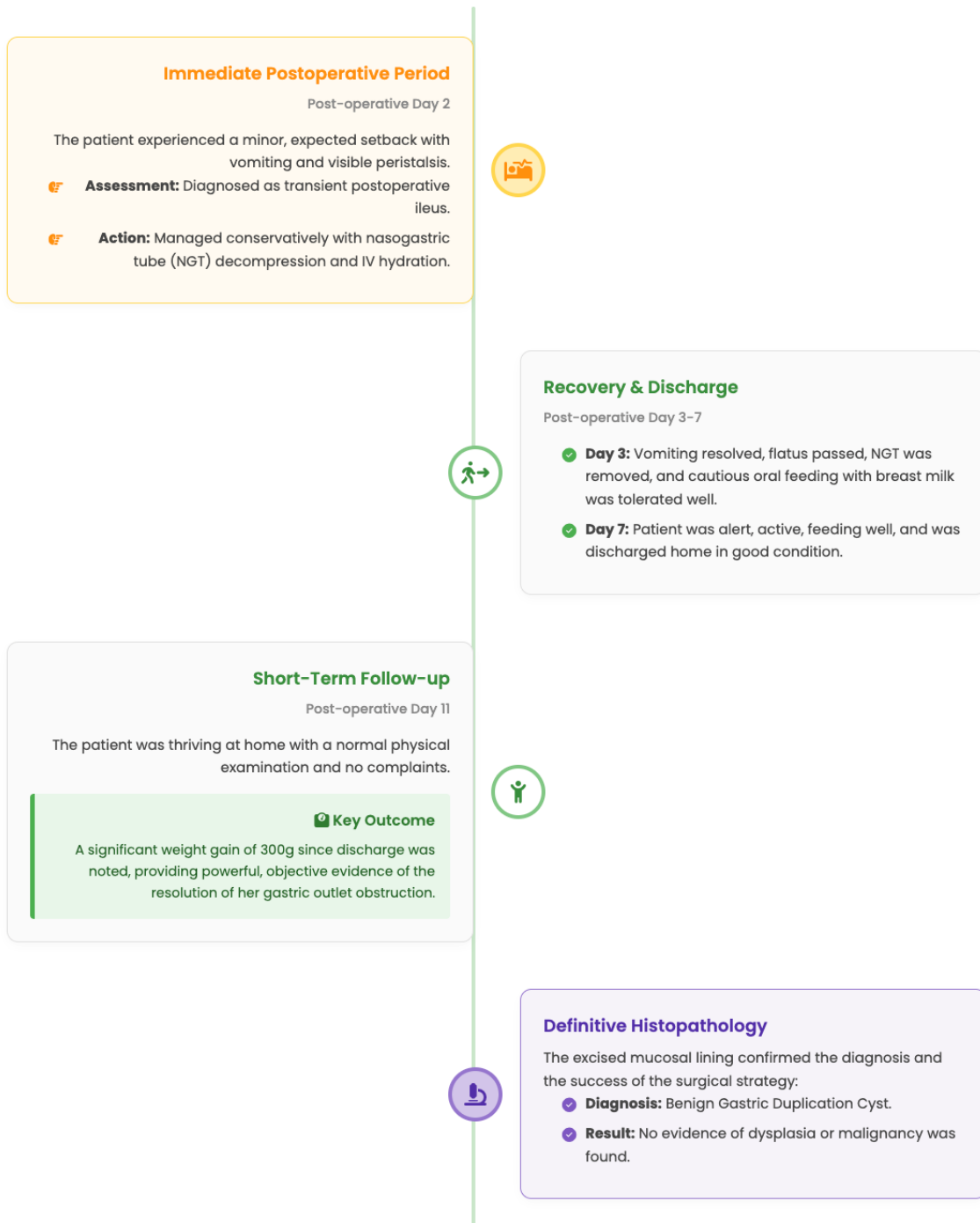
Figure 3. Postoperative course and follow-up.

A timeline of the patient's recovery, successful outcome, and definitive diagnosis.