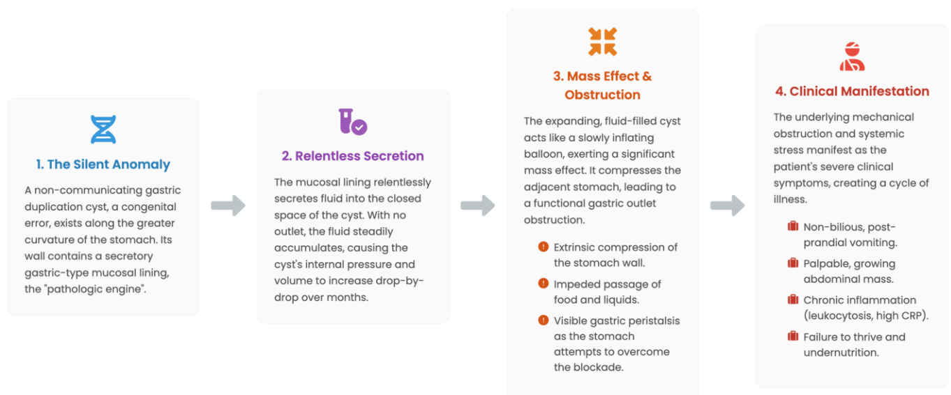
Figure 4. The pathophysiological cascade.

Tracing the progression from a silent embryological anomaly to symptomatic gastric outlet obstruction.