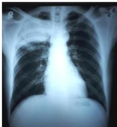
Figure 1. Thoracic X-ray showing inhomogeneous semi-opaque junction with irregular borders in the upper field of the right lung.

The patient was subjected to a CT scan of the chest where the lesions were round, homogeneous (HU: 17-30), with a cavity-like image with an air fluid level, with a size: 7.88 cm x 8.2 cm x 9.29 cm and honey comb appearance around it (Figures 2 and 3). The impression of CT scan of the chest is a lung abscess with right lung bronchiectasis, with a differential diagnosis of aspergilloma. The location of the lung abscess in this patient was in the posterior segment of the upper lobe in the right hemithorax. The patient continued with a TTNA (Transthoracic Needle Aspiration) examination with the results of Squamous Cell Carcinoma. Sputum culture examination revealed a Staphylococcus. After screening and no metastases were found, the patient was concluded in stage IIIA and planned for a lobectomy.