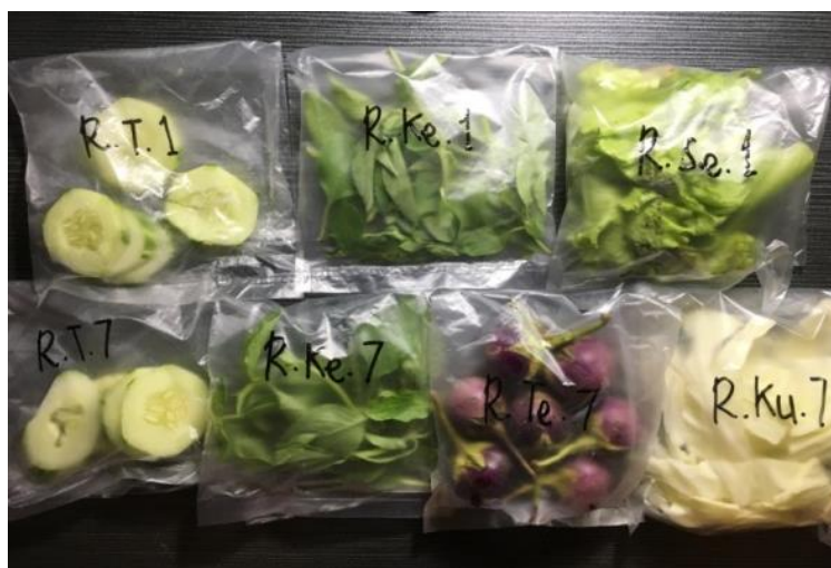
Figure 2. Types of raw vegetables served at street food stalls and restaurants in Lorok Pakjo Village, Palembang.

observations made at the Biooptics Laboratory and Medical Chemistry Laboratory, FK Unsri, from 80 samples found there were 20 positive samples contaminated with STH eggs and 60 other samples showing negative results.