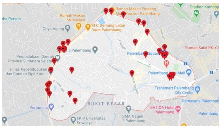
Figure 1. Map of the location of street food stalls and restaurants where raw vegetables were sampled in Lorok Pakjo Village, Palembang.

This research is a descriptive observational study