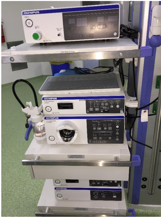
Figure 1. Video Assisted Breast Surgery (VABS)