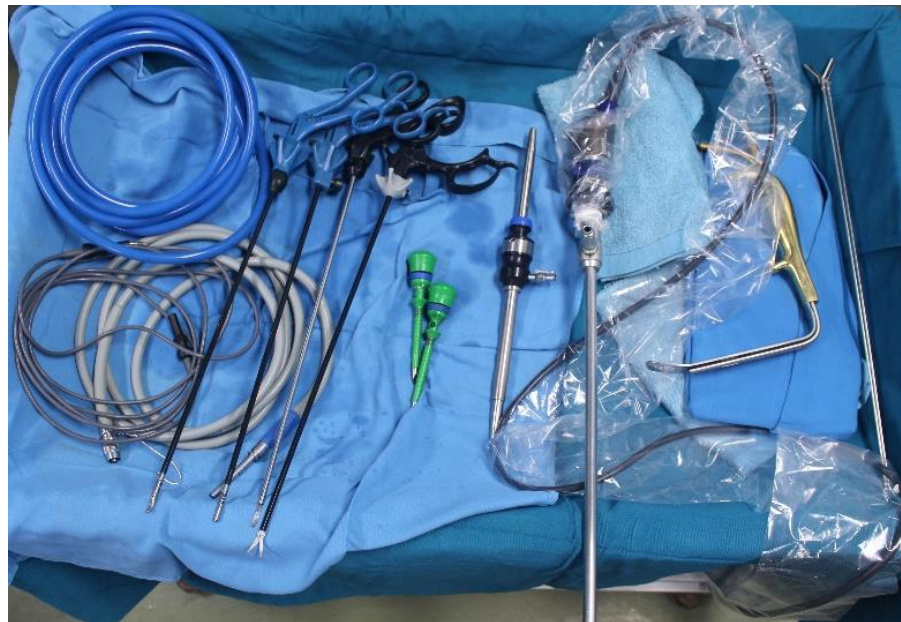
Figure 2. Equipment for Video Assisted Breast Surgery (VABS)