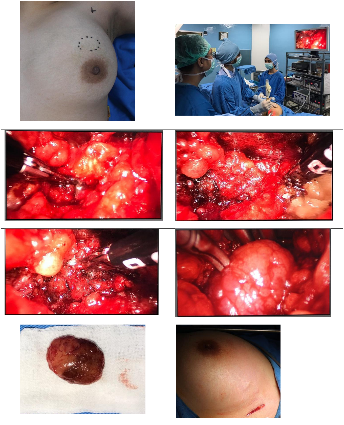
Figure 4. The procedure of Video Assisted Breast Surgery (VABS)