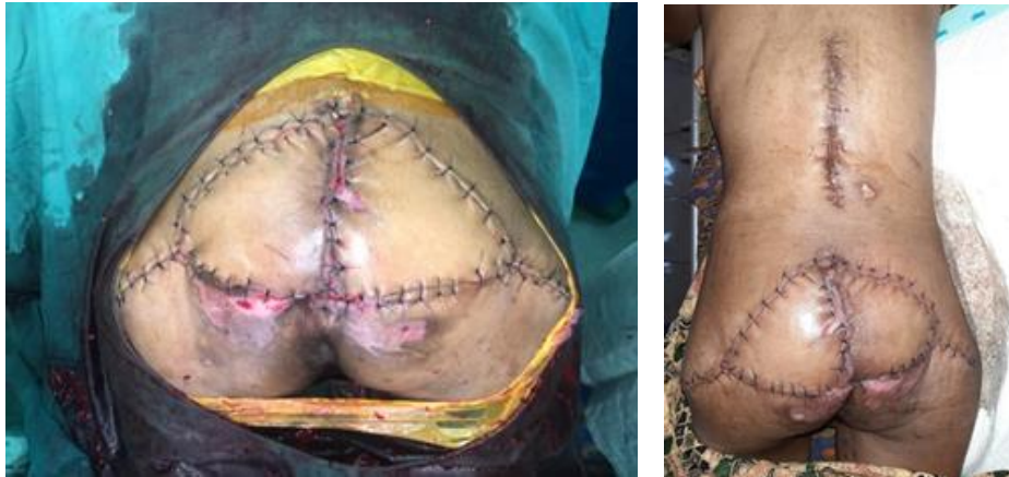
Figure 2. Overview of flap results.

our series was 12x14 cms. There was no recurrence of pressure sores in this patient in the 6-month follow-up period.